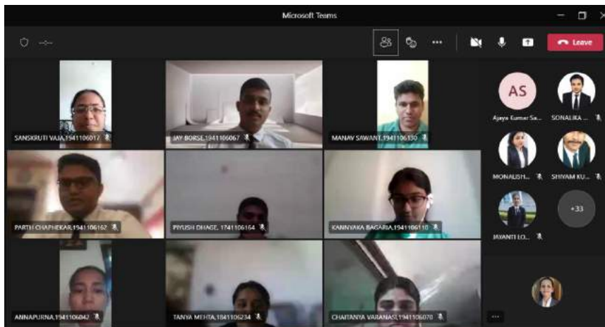
Online presentation on Culture of Gujarat & Chhattisgarh (Pic 3)