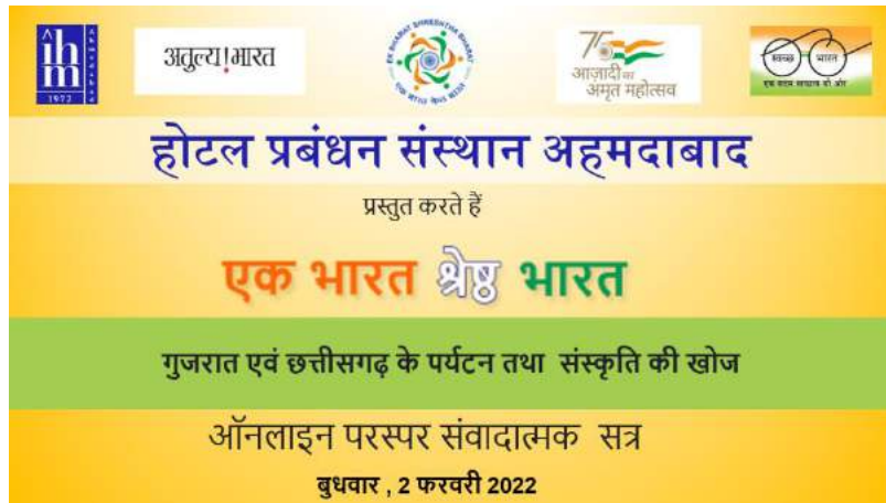
Online presentation on Culture of Gujarat & Chhattisgarh (Pic 1)