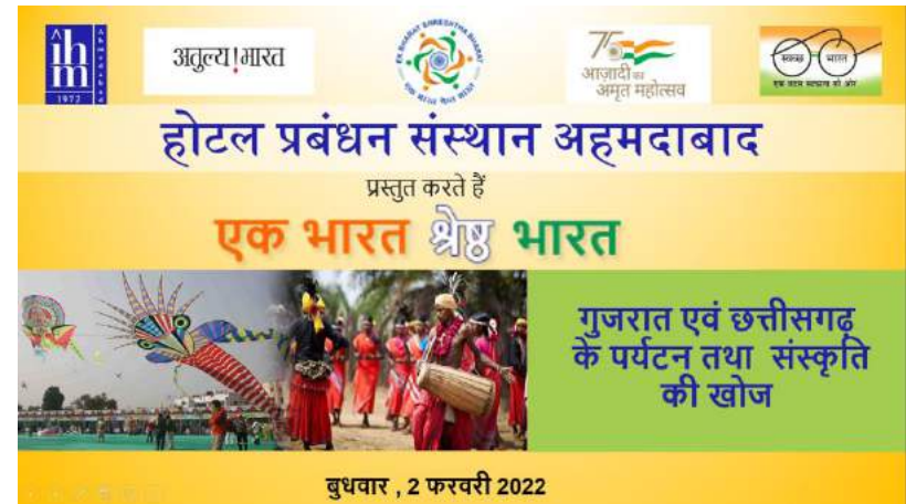
Online presentation on Culture of Gujarat & Chhattisgarh (Pic 2)